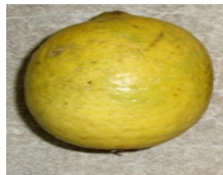
Figure 2: images5.fanpop.com

Fruits are ovoid or globose, berry, hesperidium, and yellow when ripe. 11 Fruits belonging to the citrus group are called as "hesperidium,". Fruit shape can change as the fruit matures or the trees get older and are also largely governed by variety choice. Fruit size is influenced by variety, crop load, rootstock and irrigation practices. Mature lemons turn green to yellow, weigh about 50- 80 g in weight and measure about 5-8 cm in diameter.