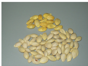
Figure 4: 2.bp.blogspot.com