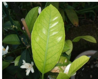
Figure 1: www.growfruitandveg.co.uk

Leaves 6.5 to 100 mm, serrulate, acute to acuminate. Leaf jointed to the petiole. Petiole narrowly winged. Leaf blade elliptic to ovate, 8-14×4-6 cm, apex usually mucronate, margin conspicuously crenulate.